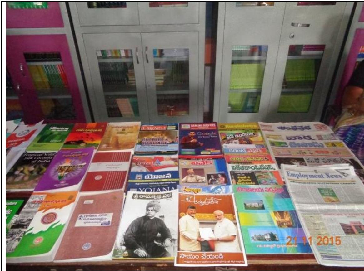
Celebrated National Library Week (Books Exhibition in the Library)