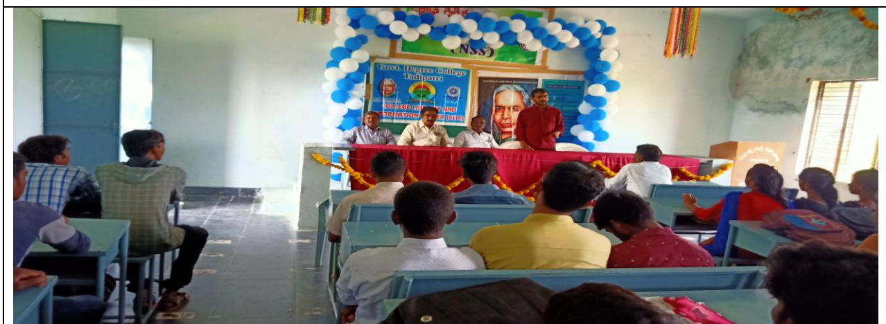
Library Induction / orientation programme on utilization of library resources