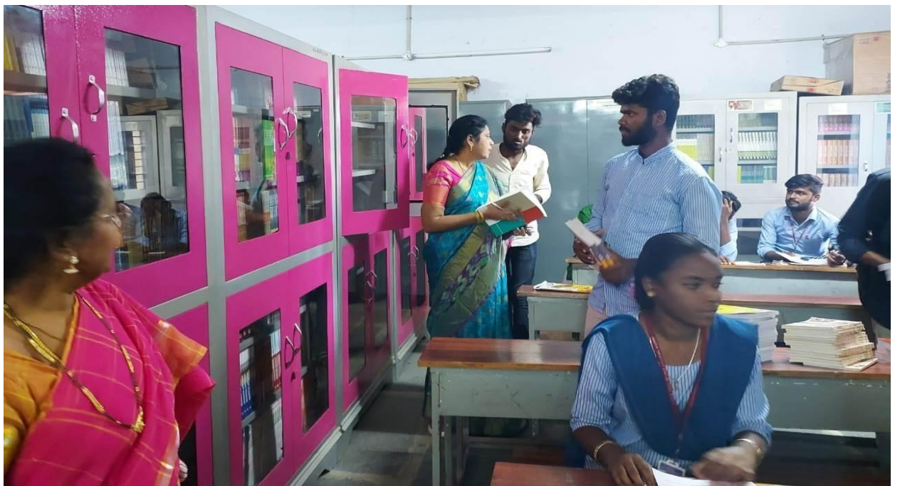
Principal Madam and the Library in-charge lecturer interacting with the students in the College Library